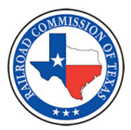
TEXAS RAILROAD COMMISSION