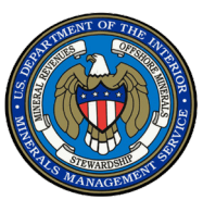
THE U.S. MINERAL MANAGEMENT SERVICE