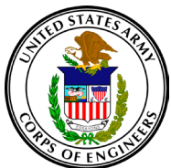
THE U.S. ARMY CORPS OF ENGINEERS