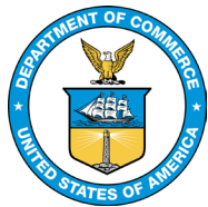
THE U.S. DEPARTMENT OF COMMERCE