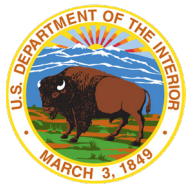
U.S. DEPARTMENT OF THE INTERIOR