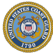
THE U.S. COAST GUARD