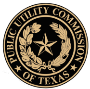
TEXAS PUBLIC UTILITY COMMISSION