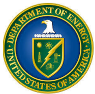
U.S. DEPARTMENT OF ENERGY